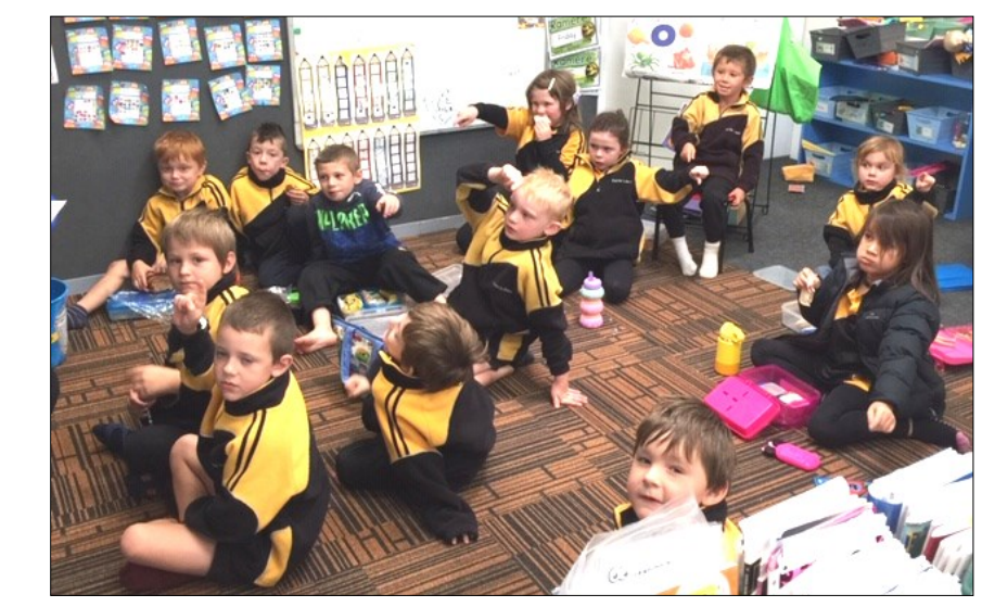
Room 1 doing their letter of the day