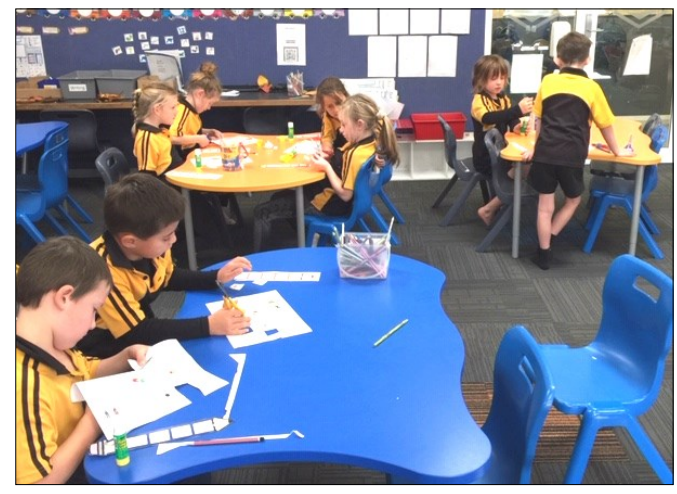
Room 2 working hard on their writing goals

We have some free 2nd hand uniform in the office foyer. Also, please see Wendy if you're wanting free shorts, pants, etc as they are stored in the office.