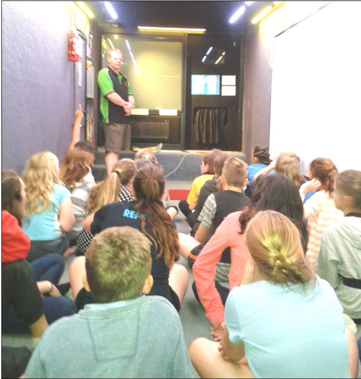
Room 4 in the Life Education caravan