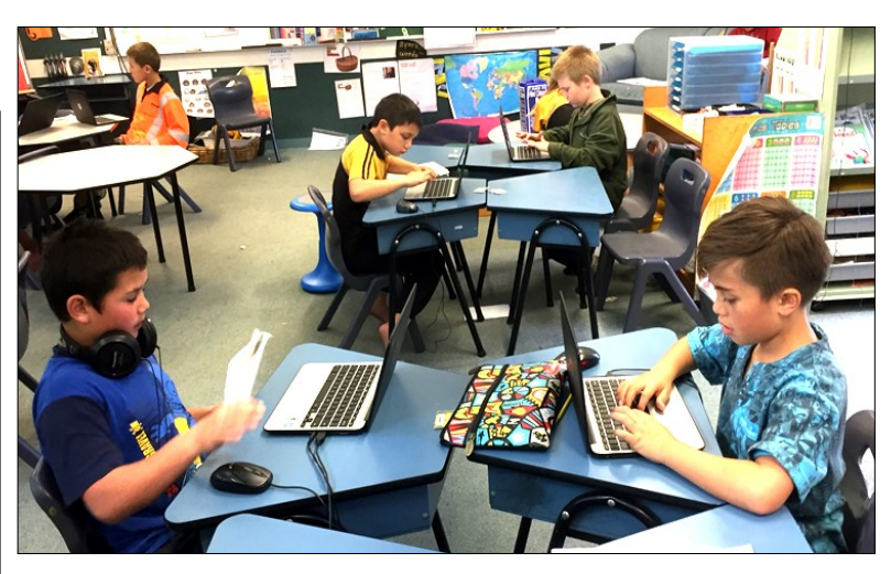
Some of Room 3 children working on their procedural writing with the chrome-books