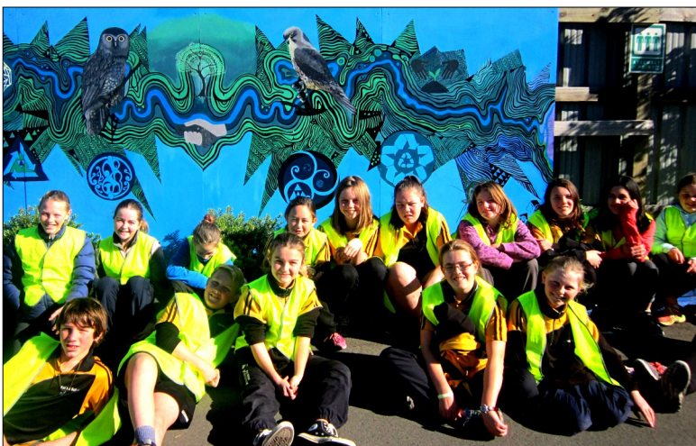
Town visit for our school

Our tennis team played well as they were up against some really good tennis players but they still managed to finish third. And our Badminton team tried their hardest and finished fourth. So overall we finished third - only one point off second in the tournament so a great effort by everyone who took place.