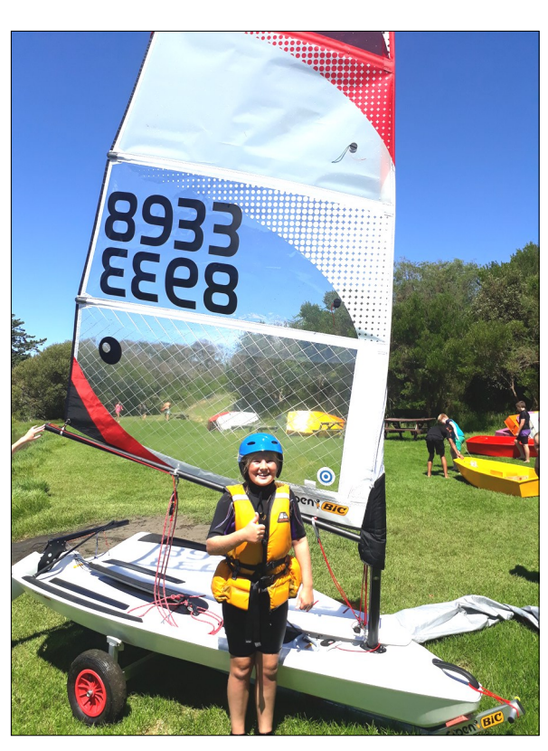
Our Seniors are learning to sail out at Pauri Lake.