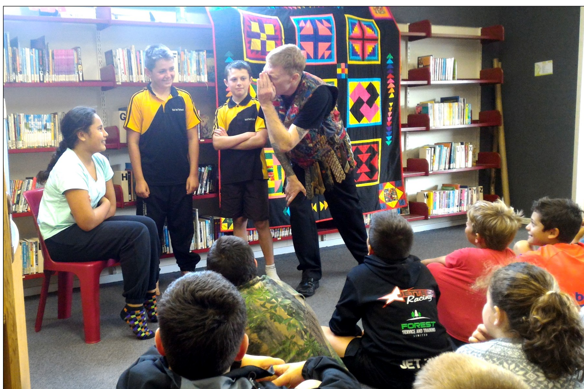
ZEBONG working and performing with some of our students. (See story over).