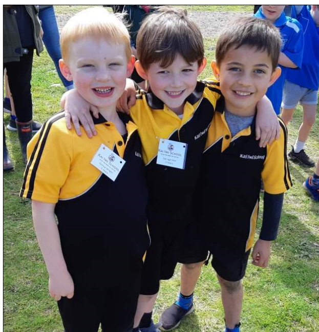
Three best buddies supporting each other at the West Country Cross Country.

REMEMBER, there is a prize for the family who get the most orders!! This fundraiser is to help with the new outdoor classroom and upgrade the playground.