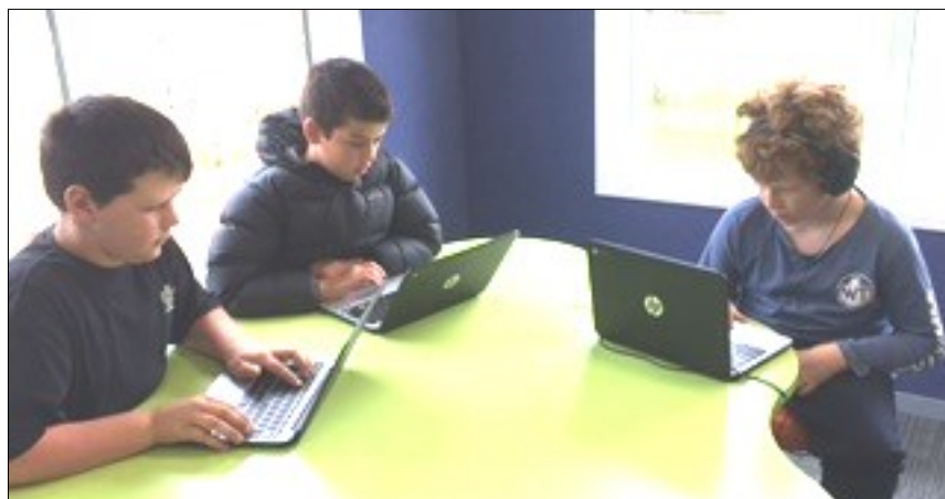
Room 2 students working on their Chrome books.