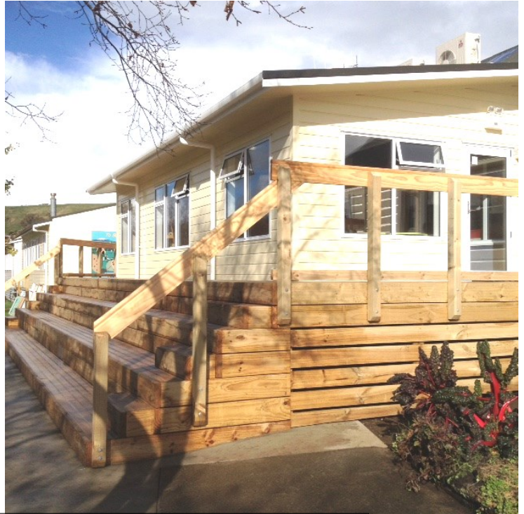
ABOVE: Outside new Breakout Room.