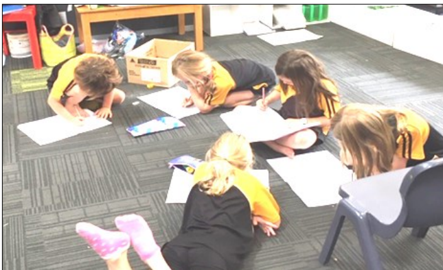
THESE GIRLS ARE WORKING INDEPENDENTLY ON THEIR PHONICS PROGRAMME IN ROOM 2