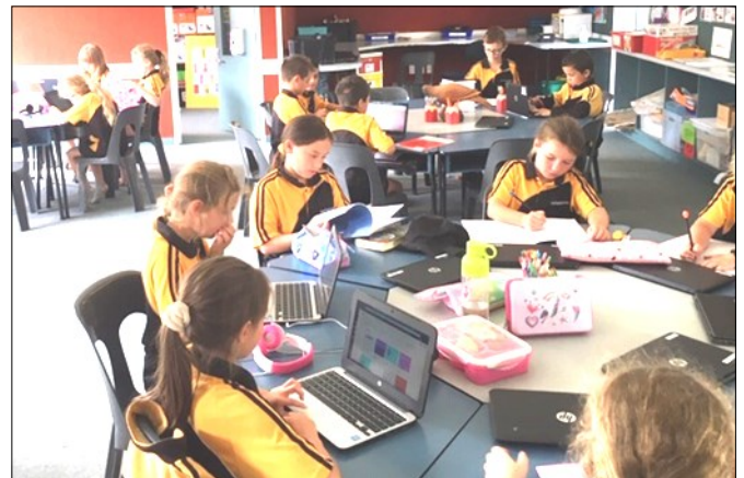
ROOM 3 CHILDREN USING THEIR CHROME-BOOKS TO HELP WITH THEIR WRITING.