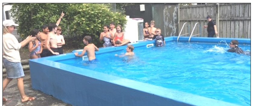
ROOM 5 CHILDREN ENJOYING THEIR LESSON TIME IN THE POOL