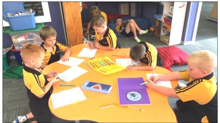
SOME ROOM 1 BOYS VERY BUSY DOING THEIR NUMBER WORK

Well it's Community Newsletter time again, the first for 2020 and I'm pleased to say Trish is still happy to write the newsletter informing everyone in our community as to what has been going on at our busy school. So instead of me repeating what Trish may have already written I decided to take a walk around the classrooms and see what our students were up to and look what I found:-