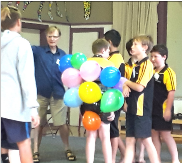
SHINE CITY programmes with our Year 7 and 8 students

Through the concepts of Significance, Resilience and Courage, boys learn to build confidence, leadership, resilience, self-esteem, manage emotions, and problem solve. The programme is delivered through group discussions and some very crazy, fun games and antics. The boys also attend a celebration at the completion of their course.