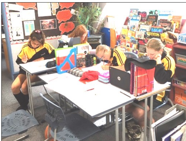
ROOM 4 GIRLS BUSY WORKING ON THEIR WORD STUDY.