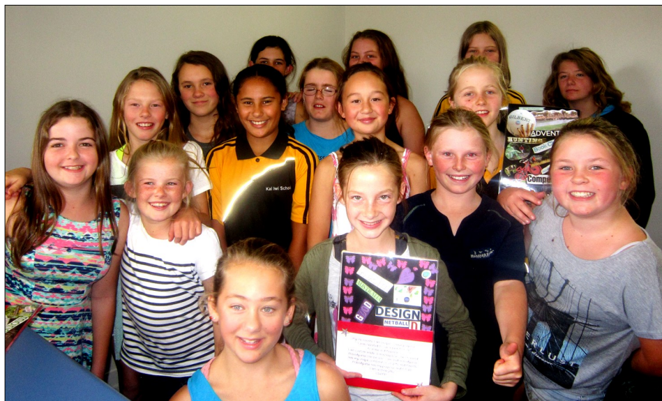
Our Room 4 'SHINE' Girls