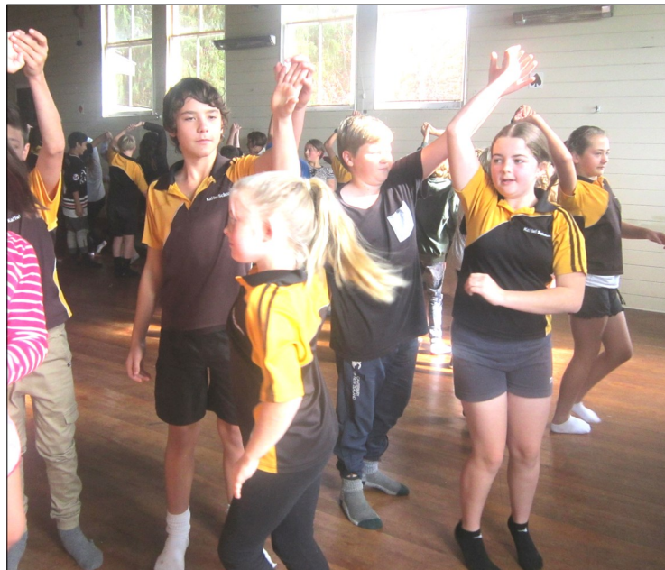
Room 4 dancing lessons at Brunswick.