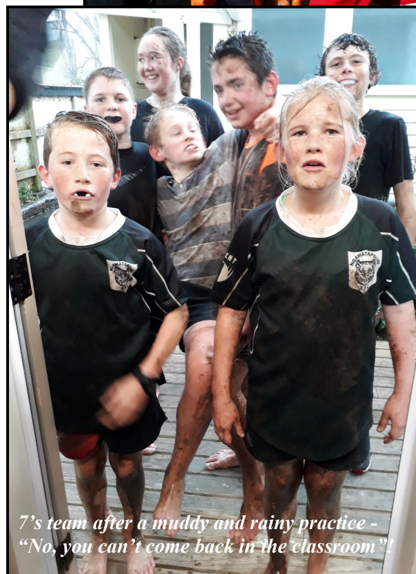
7's team after a muddy and rainy practice - "No, you can't come back in the classroom!"