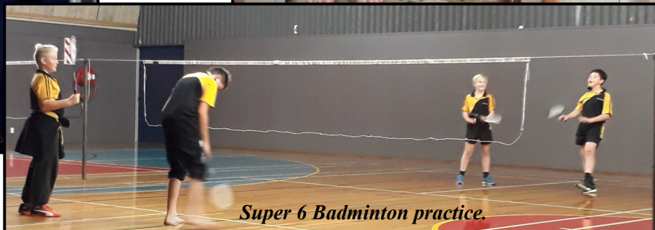
Super 6 Badminton practice.