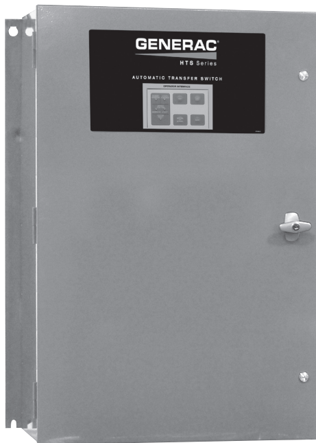
200 Amp HTS NEMA 1