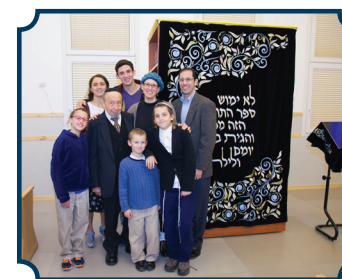
The Dreisinger Family -daughter, son in law and 6 grandchildren