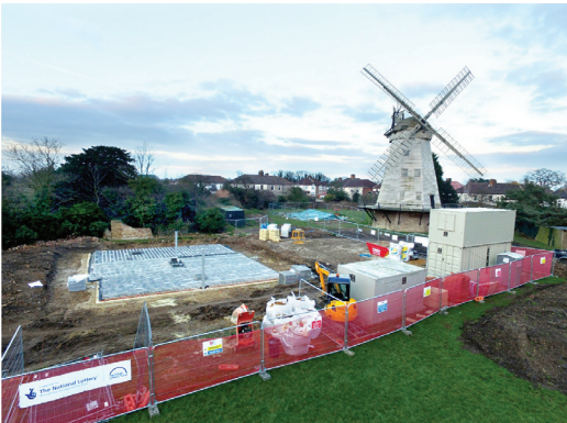
25 February 2016: Floor structure completed