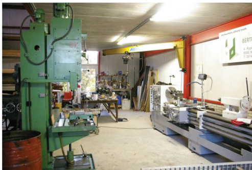
Just a few of the many excellent machines and tools available to Willem