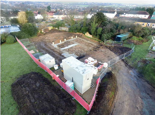
14 February 2016: Photograph of the groundworks

Work is now underway on the building of the new Education and Training Centre. The contractor (Bolt & Heeks Limited) started work on 25 January 2016. Within three weeks the ground had been cleared and levelled and the foundations had been laid and by 25 February the floor structure was in place. The structural work is expected to take about six months.