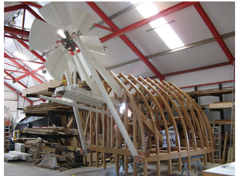
The large and impressive workshop of Bertus Dijkstra in Sloten in which entire sub-assemblies can be restored and pre-assembled