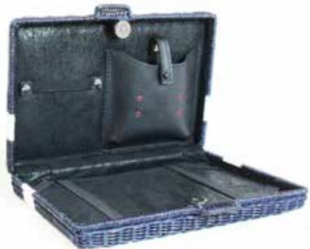
STRIPED M CLUTCH STRIPED MONO 2B CLUTCH DARK BLUE / WICKER