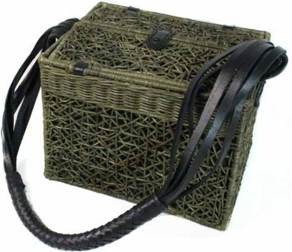
UCHIDA TEAROOM BAG FATIGUE GREEN RANDOM WEAVE WICKER