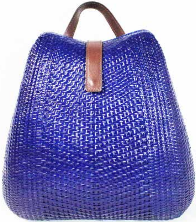
ROVER PABLO BACKPACK DEEP BLUE CHAIRCANE