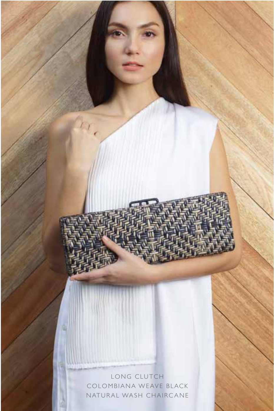
LONG CLUTCH COLOMBIANA WEAVE BLACK NATURAL WASH CHAIRCANE