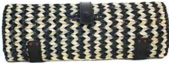
ROVER SEMI CYLINDER CLUTCH BLACK & NATURAL WATER HYACINTH ARROW WEAVE