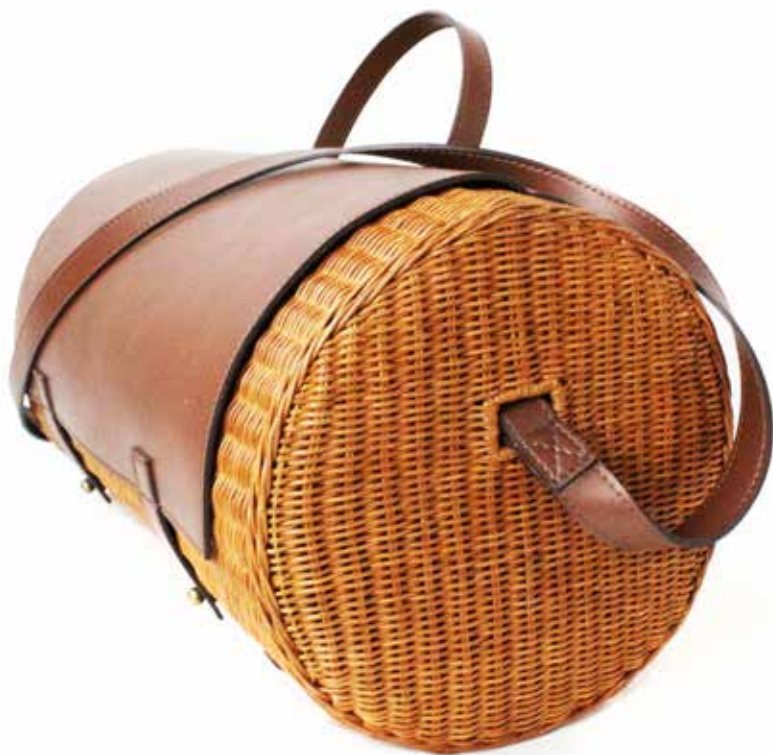
ROVER CYLINDER XL CARRYALL HONEY WICKER