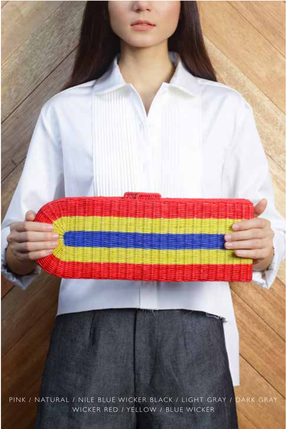
PINK / NATURAL / NILE BLUE WICKER BLACK / LIGHT GRAY / DARK GRAY WICKER RED / YELLOW / BLUE WICKER