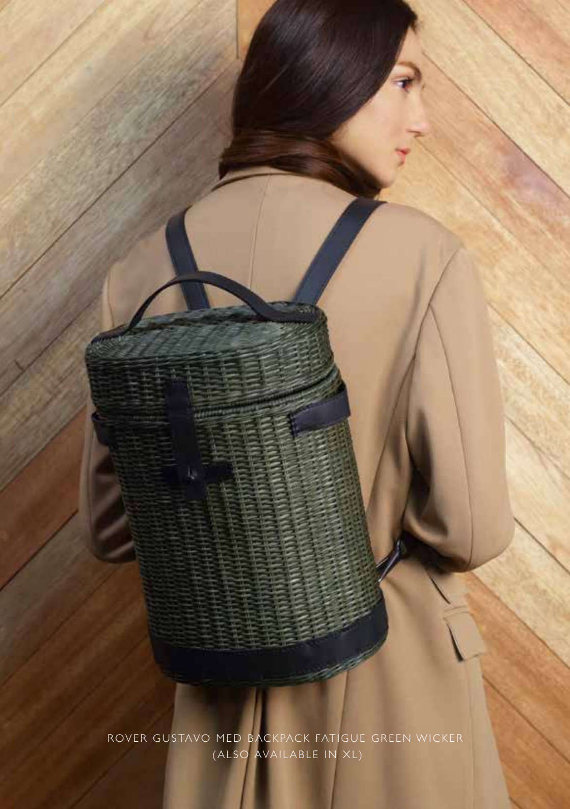
ROVER GUSTAVO MED BACKPACK FATIGUE GREEN WICKER (ALSO AVAILABLE IN XL)