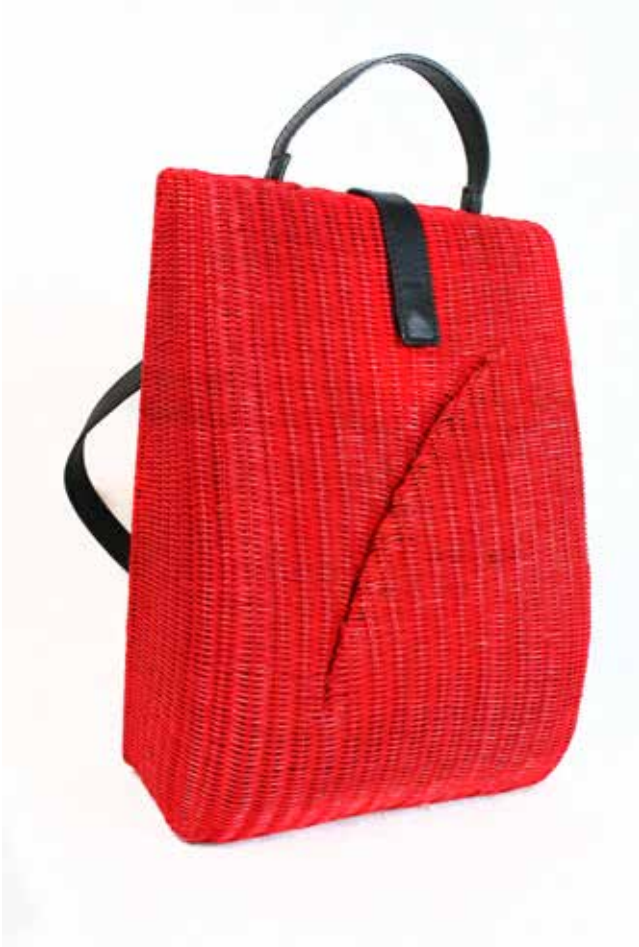
LUCIO MONO BACKPACK IS RED WICKER OPPOSITE: LUCIO DJ BACKPACK IS HONEY WICKER