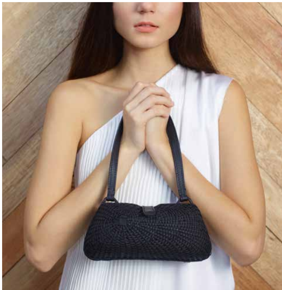
MARIKO S (AVAILABLE IN L) BLACK MATTE CHAIRCANE OPPOSITE: MONO 2B CLUTCH BLUE NILE / YELLOW / WHITE WICKER