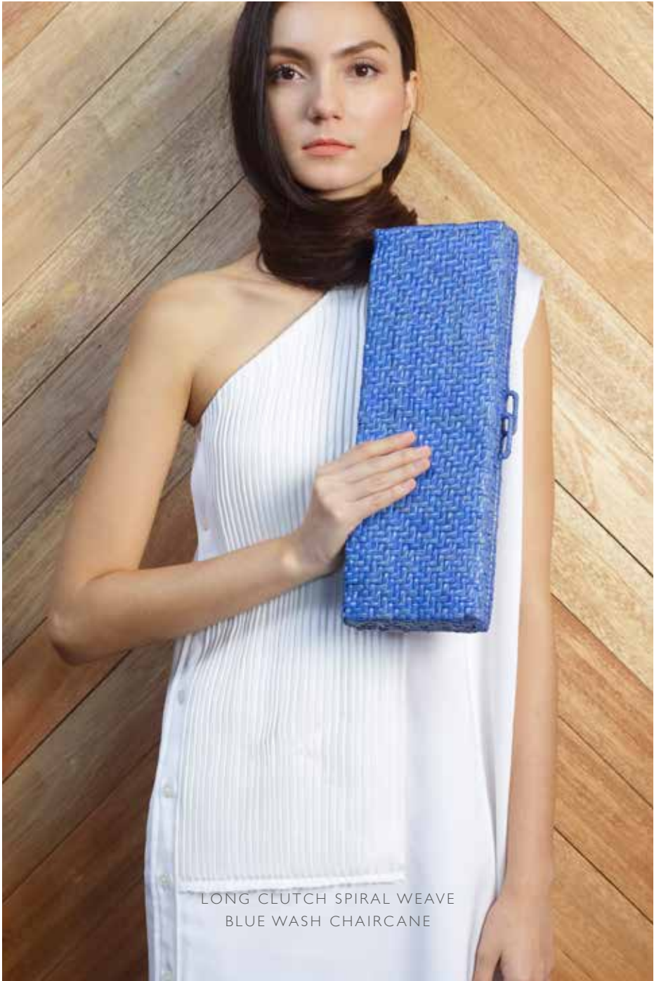
LONG CLUTCH SPIRAL WEAVE BLUE WASH CHAIRCANE