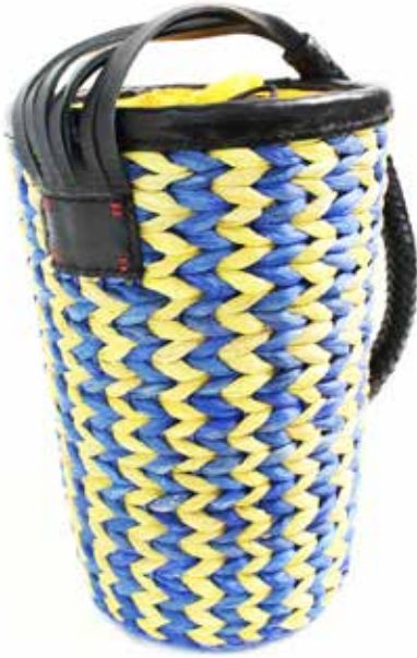
ROVER BUCKET M BLUE & YELLOW WATER HYACINTH ARROW WEAVE