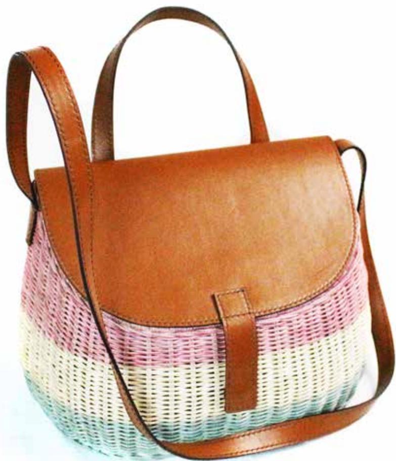
ROVER CREEL SHORT STRIPED WICKER