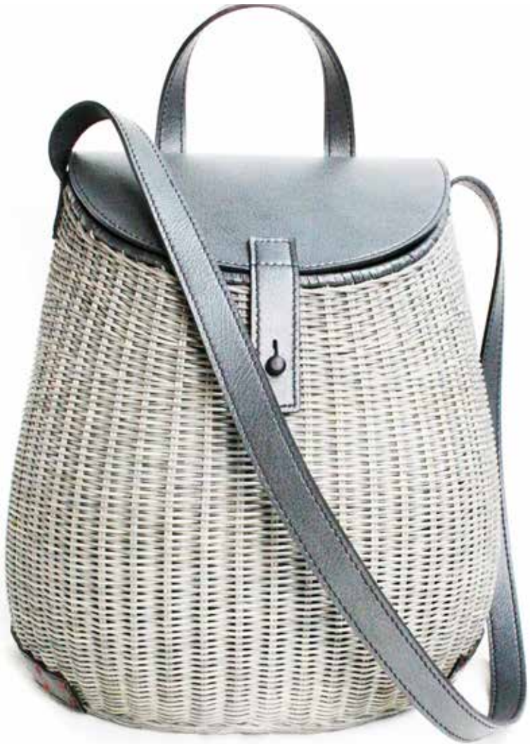
ROVER CREEL TALL GRAY WICKER