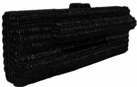
TATI SOFA CLUTCH BLACK WICKER