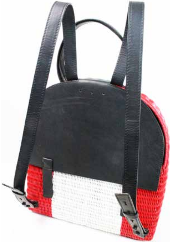
WALL VAULT BEEDBACKPACK RED / WHITE WICKER