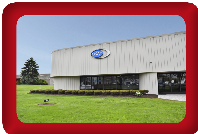
OKAY Industries - located in Berlin, Connecticut