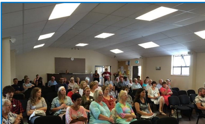
Northland Pastors & Leaders

We have also visited the following places during February and March: