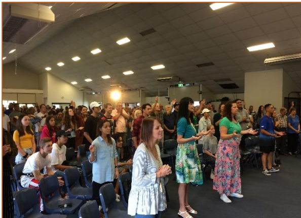
Gold Coast Chapel, Australia

During February and March , we ministered in 11 churches in New Zealand and Australia , conducting leadership meetings, Sunday services, encounter nights, and seminars: