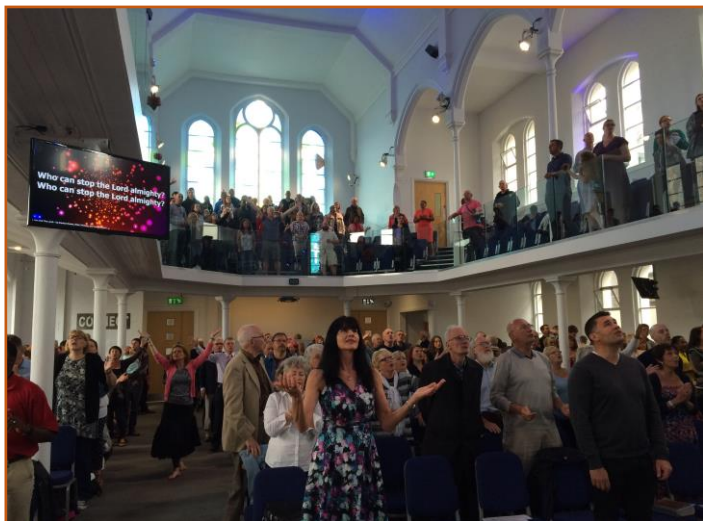
Plymouth Christian Centre

A pastor's wife in Plymouth explained that we had prayed for her six-year-old daughter the year before. The little girl had been suffering with hearing loss (due to repeated ear infections and holes in both eardrums). She had to sit at front of class to hear the teacher. That coming week she would be having hearing aids fitted. When the appointment came, the mother asked for retesting. Her hearing was completely normal, the aids were not needed, and she has been fine ever since last year.