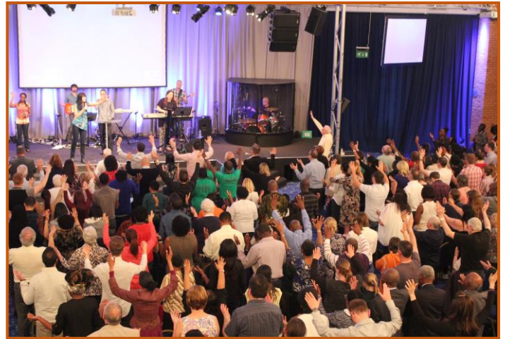
Combined Elim Churches Meeting Birmingham

One of the highlights of the trip was speaking at a combined Elim churches meeting on the evening of Pentecost Sunday at Birmingham Christian Centre, a large Elim church in the city centre. 10 -12 Elim churches from across the city and area combined together for a time of celebration, testimony, preaching, and ministry. The Holy Spirit came powerfully at the end of the meeting. Many experienced God's fire (a literal heat in their bodies) and hundreds were prayed for. One recently converted Muslim girl told us that she had never experienced anything like it before.