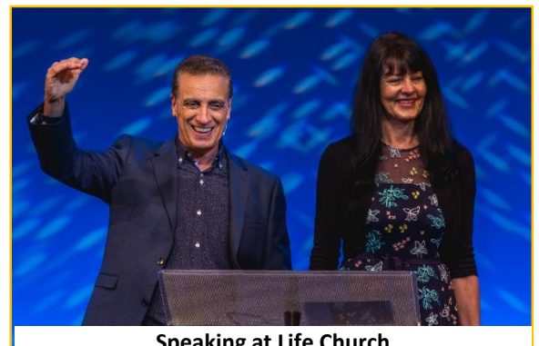
Speaking at Life Church