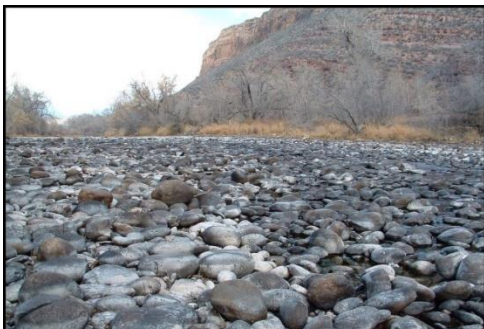
Dried Up River Jordan

Consider the Red Sea crossing. Israel had just escaped slavery in Egypt. Camped in a valley with mountains and desert either side, an Egyptian army bent on destroying them behind, and an impenetrable sea in front, they were in trouble. There was no way through humanly speaking. Yet God had a way: he told Moses to stretch out his rod (which symbolizes authoritative prayer) towards the sea. (See Exodus 14) The waters did not part immediately. Instead, God sent a very strong wind that blew all night and caused the waters to divide so that they formed a dry channel to pass through. God made a way that no human eye could see. But it took all night. Often we can be stuck in a long night of adversity with no seeming way of escape. But if we will stretch out our rod and keep declaring that he is the way maker and miracle worker, the waters will part.