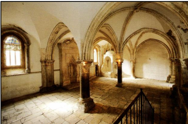
The Upper Room