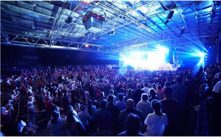
NZ & Beyond Auckland